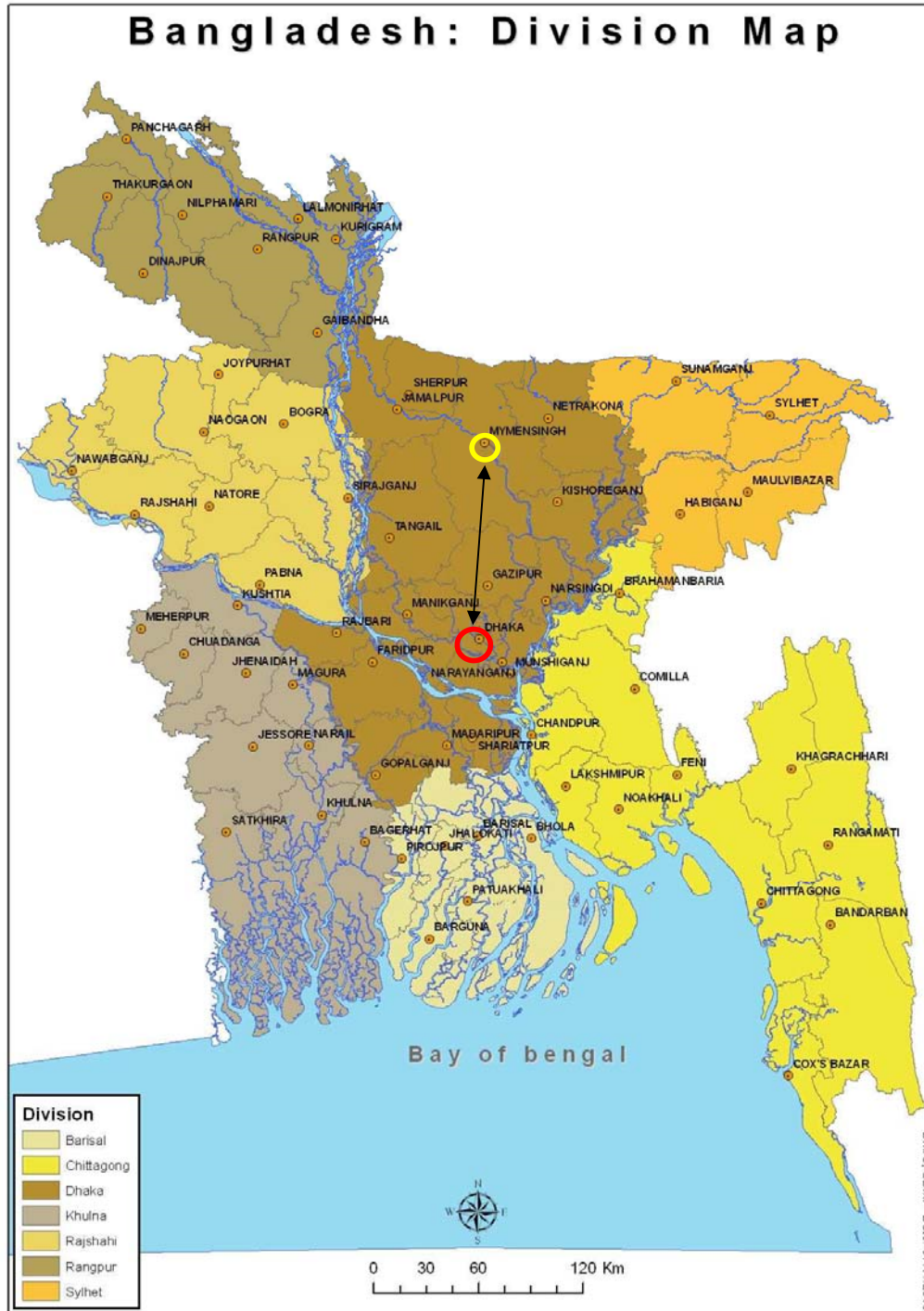
Figure- 3.1: Location of Mymensingh Project Area (MSDP, 2011-2031) in the context of Bangladesh.