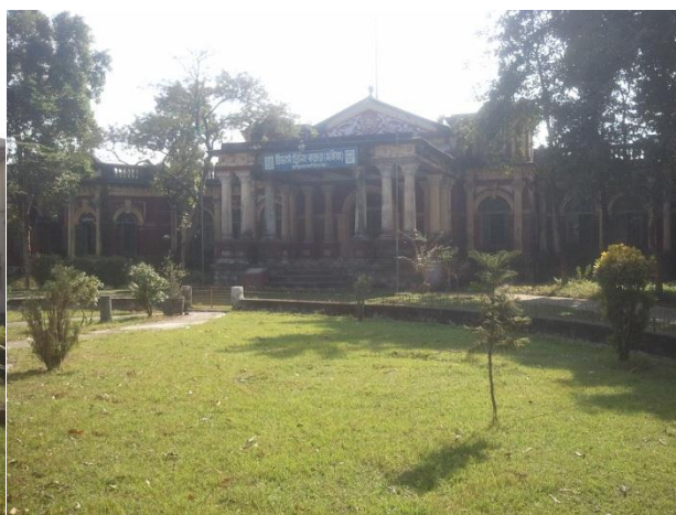
Figure 3: Outlook of Shoshi Lodge