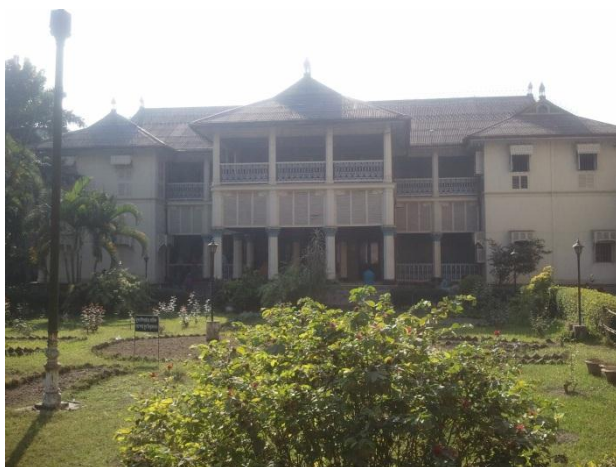
Figure 2: Outlook of Gouripur Lodge

condition of buildings is a matter of concern for immediate preservation and conservation. For both condition (low and very low), percentage of building condition is 21% respectively.